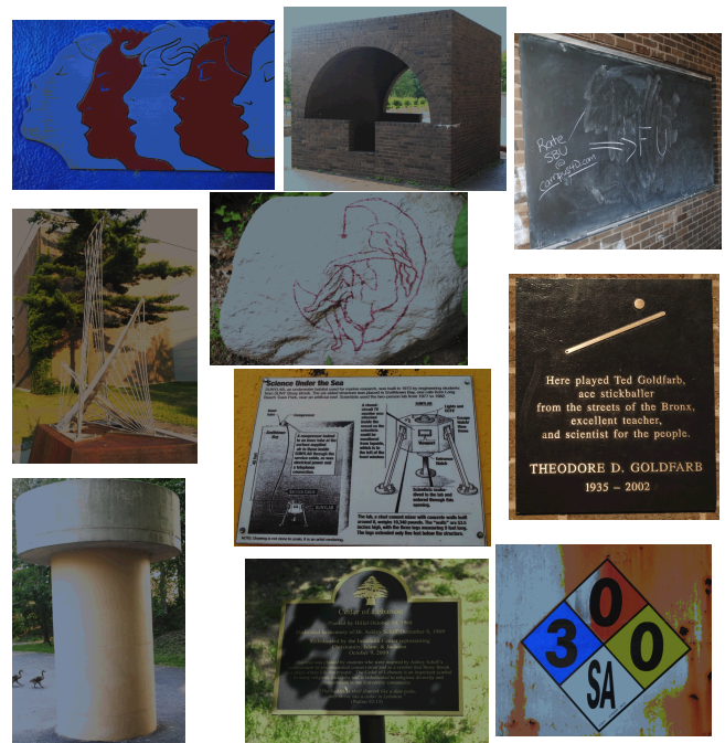
Figure 1: Close-up views of 10 targets seen by Givers (L to R, top to bottom): Patriotic faces, Mushroom house, Outside chalkboard, Ship sculpture, Sorority rock with girl, Spaceship label, Goldfarb plaque, Cylindrical cement structure, Cedar plaque, Warning sticker

Status of Corpus Project The corpus being released to the research community includes 36 digitally recorded spoken dialogues (with associated data on individual differences and experimental parameters). The navigational dialogues from these pairs have all been transcribed in detail (including disfluencies and pauses, along with time stamps). A full article in preparation will present data on the content and sequencing of referring expressions and navigation strategies. Here, we report findings from the post-navigation recall test, entrainment data from the 6-round referential communication task, and effects of spatial ability.