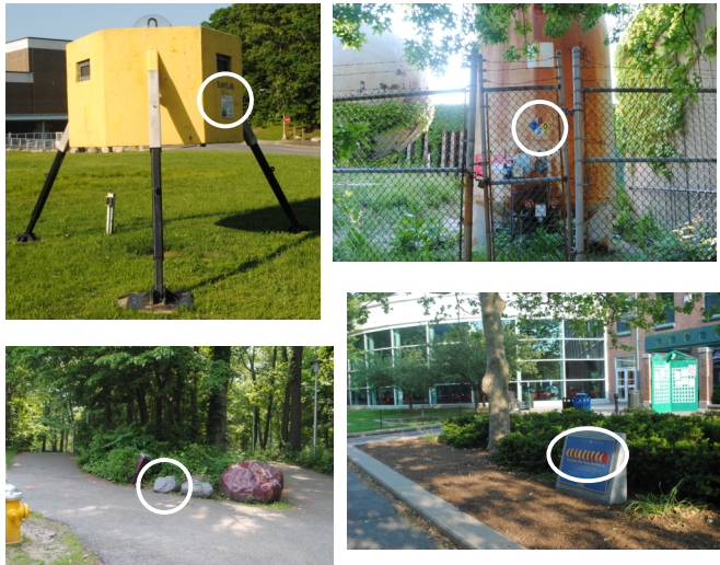
Figure 2: Extra visual context provided to Giver (without highlight) for selected targets from Fig. 1: Spaceship label, Warning sticker, Sorority rock with girl, Patriotic faces.

The student assigned to the role of direction-Giver (G) remained inside the lab with a landline phone to direct the student assigned as Follower (F) to locations on campus.